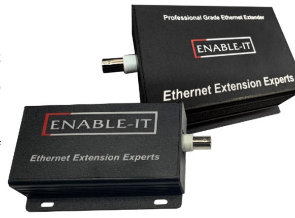
FEATURES & SPECIFICATIONS